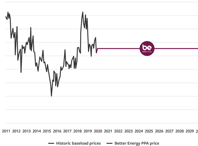
BETTER ENERGY PPA

if your energy supply is not free from CO 2 . Along with carbon taxes, certificate prices will also rise, making them an even less attractive alternative. With a PPA, you have future-proofed your business. You have secured green energy with true additionality, and you are assured zero carbon status for many years to come.