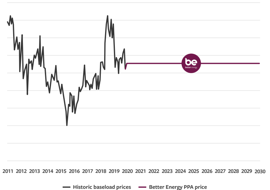
BETTER ENERGY PPA

if your energy supply is not free from CO 2 . Along with carbon taxes, certificate prices will also rise, making them an even less attractive alternative. With a PPA, you have future-proofed your business. You have secured green energy with true additionality, and you are assured zero carbon status for many years to come.